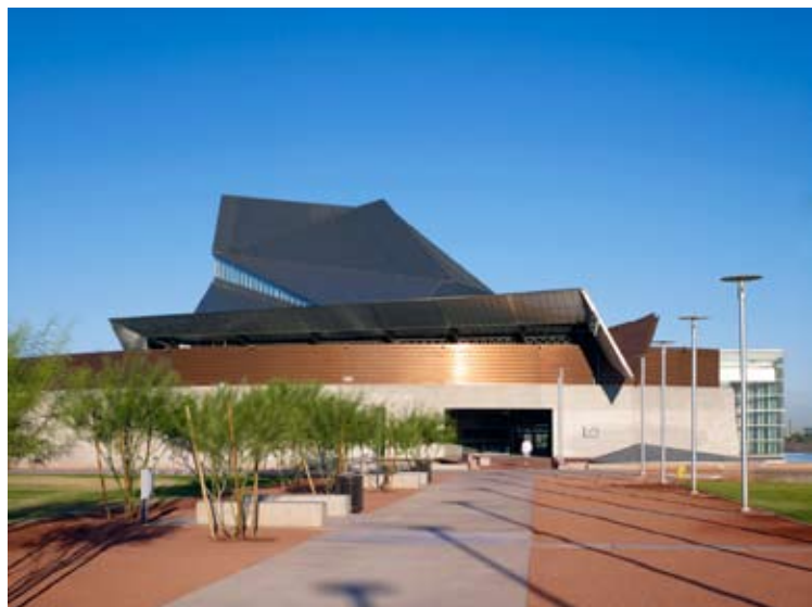
Tempe Center for the Arts, AZ