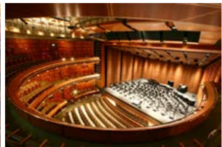
Tempe Center for the Arts, AZ