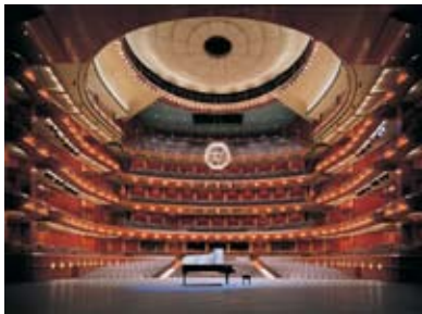
New Jersey Performing Arts Center, Newark, NJ