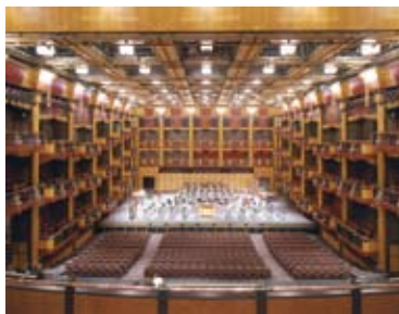
Cerritos Center for the Performing Arts, CA